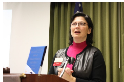
The 2010 Best Practices Award was proudly displayed at the November chapter meeting on November 18, 2010.

To cap off a great conference we had wonderful entertainment. The Water Cools keep us entertained as the Best Practices Chapters were honored and during the Saturday Evening Banquet we were all entertained by The Four Bitchin' Babes.