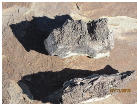
Dinosaur Bones found at Ah Shi SlePah Wilderness Study Area

Like the Bisti and De-Na-Zin wildernesses a short distance northwest, Ah-Shi-Sle-Pah Wilderness Study Area is a little known region of fantastic eroded rocks in the high desert of northwest New Mexico, a generally flat, sandy and uninhabited land drained by shallow washes that eventually meet the San Juan River . Some of the land is part of the Navajo Indian Reservation, and other areas are used for oil and gas drilling, but most is empty, yet access is quite easy since a network of dirt roads criss-cross the desert, many in good condition except after recent rainfall when some become impassable. The WSA is centered on Ah-Shi-Sle-Pah Wash , a minor drainage running through a wide, barren