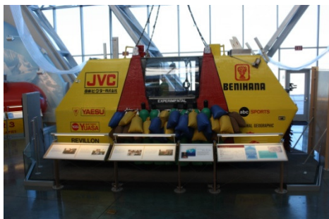
Exhibit showing the Double Eagle V system as it appeared on the first ever Trans-Pacific balloon flight.

The Anderson-Abruzzo Albuquerque International Balloon Museum is a destination unto itself here in the Albuquerque area featuring artifacts covering almost 230 years of the evolution of ballooning.