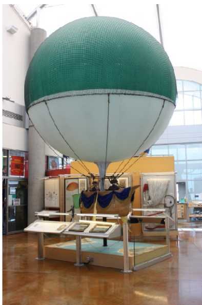
Display at the Anderson-Abruzzo Albuquerque International Balloon Fiesta depicting the balloon, piloted by Jean-Pierre Blanchard and Dr. John Jeffries, that made the first English Channel crossing on 01/07/1785. See page 7 for more details.